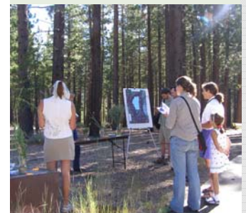
2007 Invasive Weeds Tour