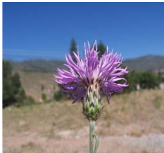
Spotted knapweed Centaurea biebersteinii

Three important 2007 LTBWCG cooperative projects included: 1) support of the development and use of innovative integrated pest management techniques, including the precision application of herbicides utilizing the "Dip and Clip" treatment method, 2) assistance to landowners in the Angora Fire area to survey and treat historical weed infestations during the critical post-fire