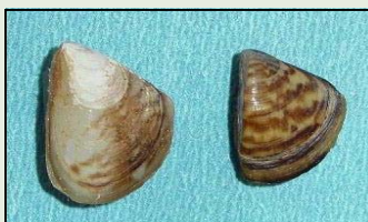
Left: Quagga mussel Right: Zebra mussel