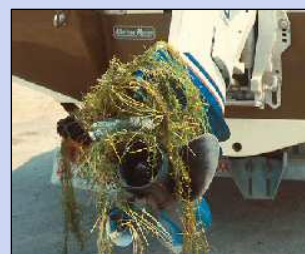
Boat contaminated with Eurasian Water Milfoil