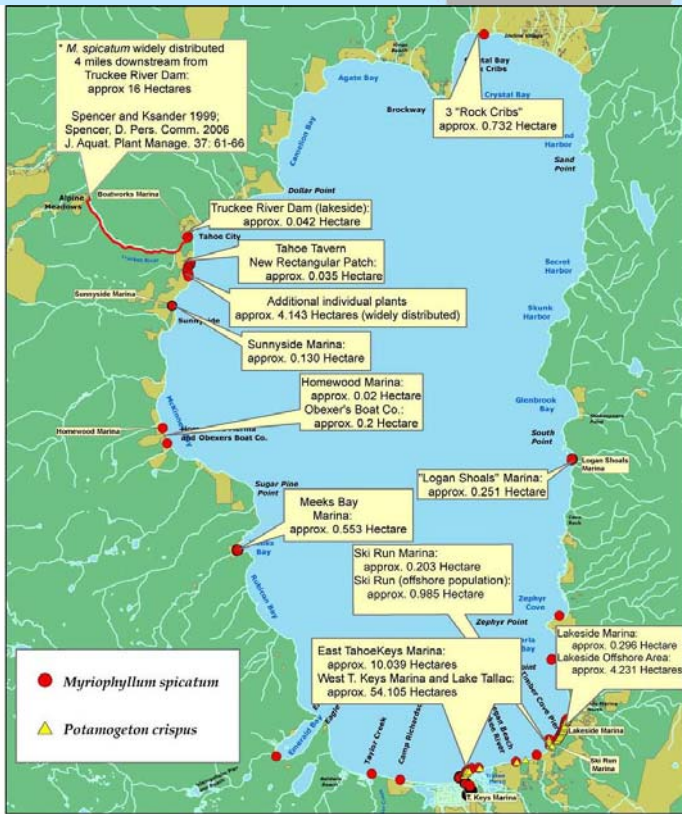
Lake Tahoe Survey 2006 Area Coverages of Myriophyllum spicatum (Hectare)